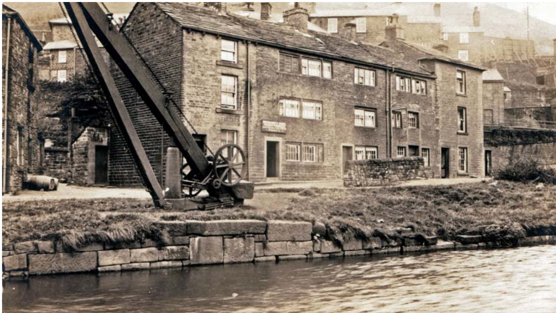
The Mechanics’ Arms, Frenches Wharf, Greenfield c1905