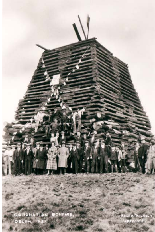
Delph 1937 [Saddleworth Museum M/P/Dp11.]