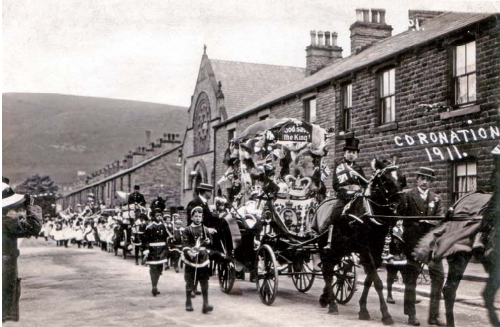
Greenfield 1911

These and other photographs in the Archives show the events were celebrated and the mass participation they attracted. But the Archives have, given the importance attached to the celebrations, very few photographs particularly of the post-Edwardian years. Any items either as donations or to scan and return would be most welcome.