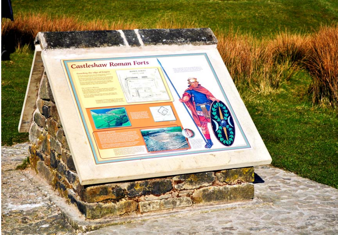
One of the new interpretation panels at the Castleshaw roman forts. Saddleworth Historical Society has played an active role in their production.