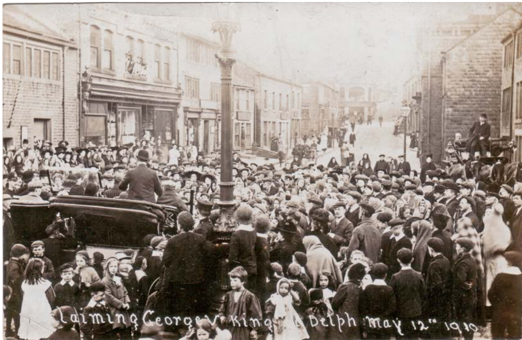
Delph 1910 [Saddleworth Museum M/P/Dp3.]