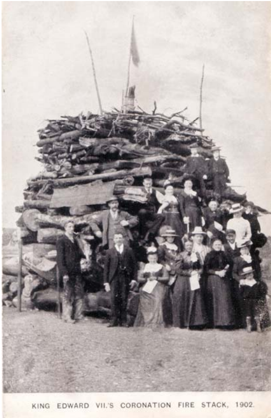
Delph 1902